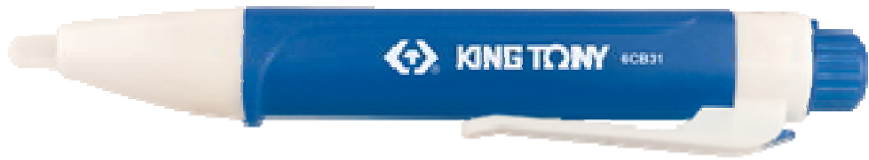
Figure 1 General Appearance View